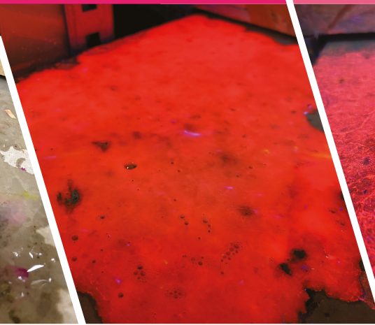
BEFORE DRYING (UNDER UV)