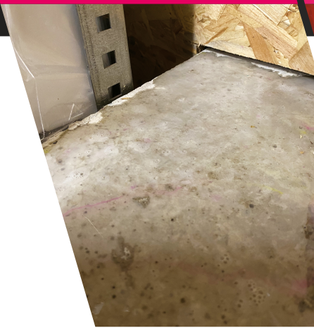
VIEW UNDER NATURAL LIGHT